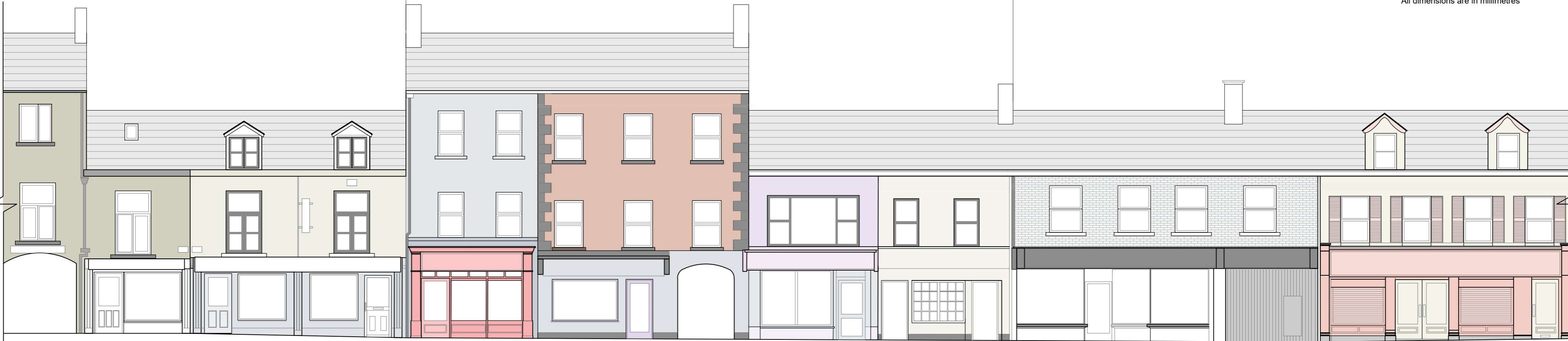
Existing Dublin Street Elevation SCALE 1:100

NOTES This drawing is the copyright of the Architect and must not be reproduced or used without permission. All dimensions are approximate and are to be checked on site by contractor prior to commencement of all work. Discrepancies should be reported immediately. DO NOT SCALE THIS DRAWING. All dimensions are in millimetres